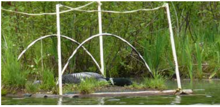
Loon nesting on platform at South end of the lake